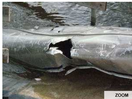
The force of the water can be strong enough to tear holes in an aluminum canoe. Recent rain has increased the volume of water flowing through the dam, which adds to the turbulence.